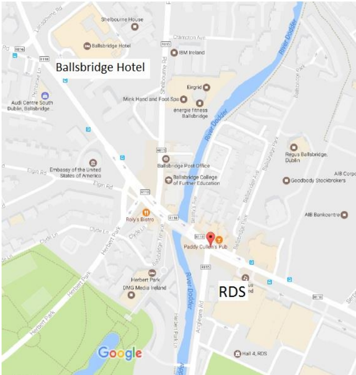
Figure 3: Ballsbridge Area Map

Ballsbridge Hotel Pembroke Road Dublin 4